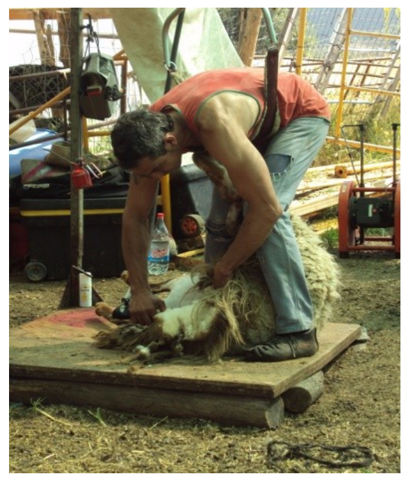
Sheepshearer, Puebla de la Sierra (Madrid)