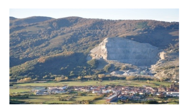
Quarry, Urbasa (Navarra)

Examples: trees, forests, mines, quarries, oil and natural gas wells, animals, etc.